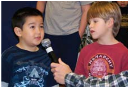
Tell us what you really think.

It will be interesting to learn whether an appearance on Science Friday fosters a lasting love or keener eye for science. We are tracking the number of students who participate and are creating a video bank of all appearances on Science Friday for our website (see Internet Resources). We plan a short survey for students, parents, and staff to evaluate Science Friday . We also plan a study on the effects of Science Friday on students' interest in and aware-